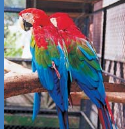
Penang Bird Park