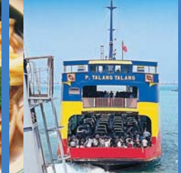
Penang Ferry Service