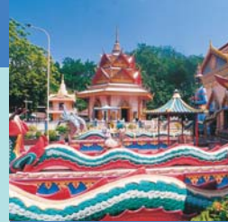
Wat Chaiya Mangkalam