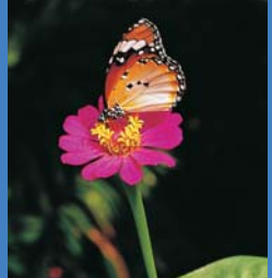
Penang Butterfly Farm