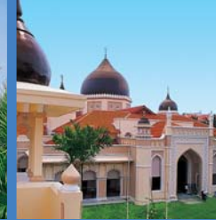
Kapitan Keling Mosque