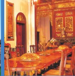
Pinang Peranakan Mansion