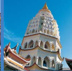
Kek Lok Si Temple